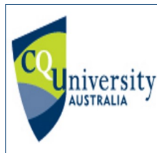
Central Queensland University